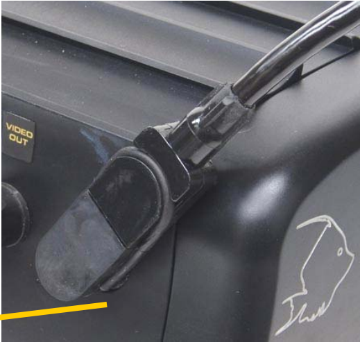
6 pin connector mated and secured with retainer strap

Insert and fully seat the connectors to each other. The 6 pin connector can also be secured by a retainer strap.